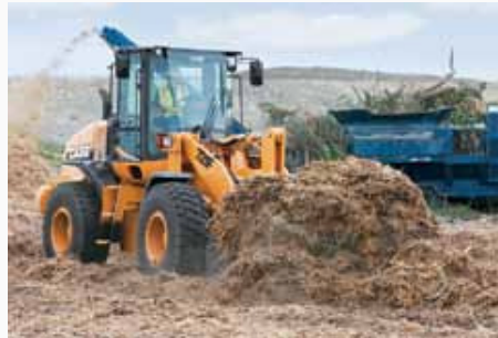
The powerful 6.7-liter engine delivers best-in-class horsepower

The new 721F, 821F and 921F wheel loaders flat-out deliver. Stronger and faster hydraulics deliver superior productivity and performance. An optional two-lever hydraulic control system meets the needs of high-production operators. Plus, the new five-speed transmission with lockup torque provides faster acceleration and quicker cycle times.